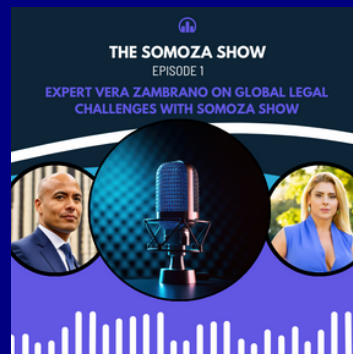
THE SOMOZA SHOW EPISODE 1: CRIMINAL JUSTICE SYSTEM IN U.S. AND E.U.