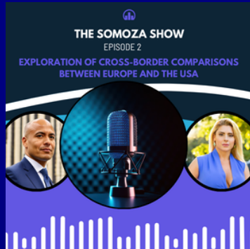
THE SOMOZA SHOW EPISODE 2: EXPLORATION OF CROSS-BORDER COMPARISONS BETWEEN EUROPE AND THE USA