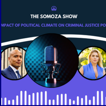
THE SOMOZA SHOW EPISODE 5: THE IMPACT OF POLITICAL CLIMATE ON CRIMINAL JUSTICE POLICIES