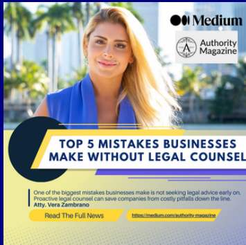
AUTHORITY MAGAZINE: AUTHORITY MAGAZINE (MEDIUM): TOP 5 MISTAKES BUSINESSES MAKE WITHOUT LEGAL COUNSEL