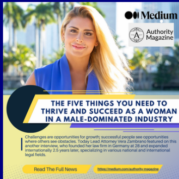
AUTHORITY MAGAZINE: THE FIVE THINGS YOU NEED TO THRIVE & SUCCEED AS A WOMAN IN A MALE-DOMINATED INDUSTRY