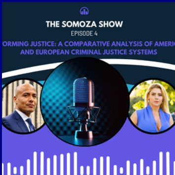
THE SOMOZA SHOW EPISODE 4: INTERNATIONAL COMPARISON OF PRISON PHILOSOPHIES US AND EUROPE