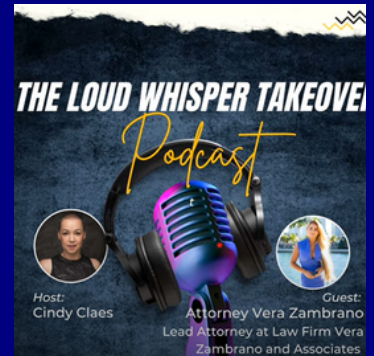
THE LOUD WHISPER TAKEOVER PODCAST: INTELLECTUAL PROPERTY ESSENTIALS FOR ARTISTS: INCLUDING AI AND EVENTS