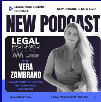
LEGAL MASTERMIND: INTERNATIONAL LAW AND LEVERAGING CONTENT FOR GLOBAL REACH