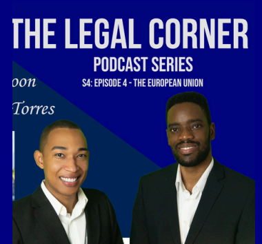
LEGAL CORNER PODCAST: THE EUROPEAN UNION