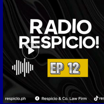
RADIO RESPICIO: WINNING STRATEGIES FOR BUYING PROPERTY ABROAD: LEGAL INSIGHTS WITH ATTY. VERA ZAMBRANO